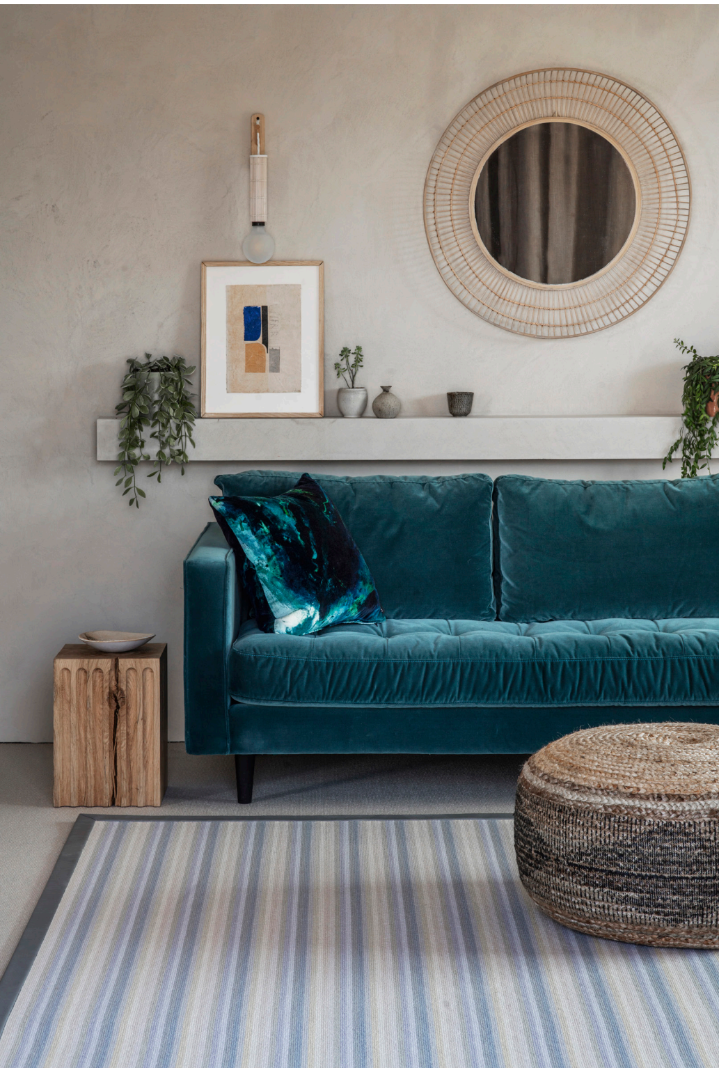
Image: Alternative Wool Rhythm Temptation rug with a Faux Leather Dove border On top of Wool Motown Tammi carpet

View Wool Rhythm here https://www.alternativeflooring.com/products/carpets/striped-carpets/wool-rhythm