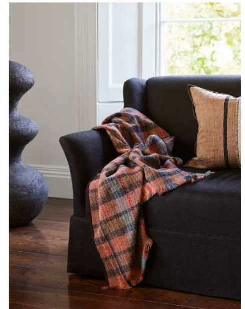
Curtain Dahna Scorched Earth, Chairs Warrior, Horizon Striped-Linen Cushion | Stampede Tigers Eye, Assegai Gold Bronze | Autumn Pecan Terracotta, Ochre, Ebony, Tea, Honey, Ivory Tan | Throw Shuka